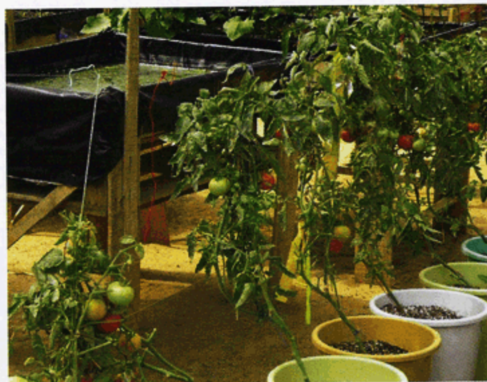
Tomato vines grown in hydroponics.